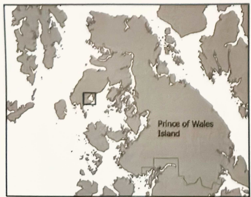
Vicinity Map 1 in = 32 miles